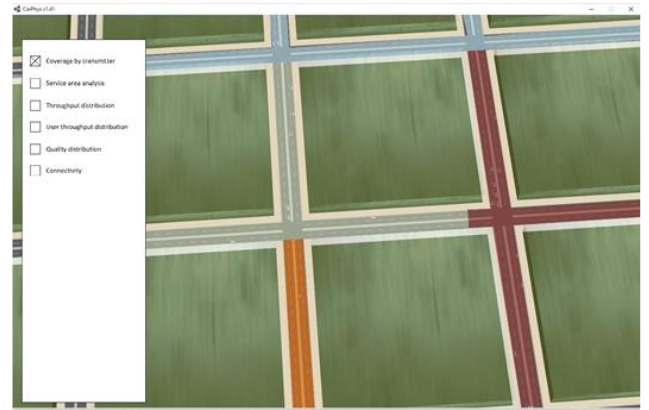
Fig. 1 View of the UNITY 3D representation of a Manhattan grid

A minimum yellow phase duration of 4.5 s has been calculated as the time needed by a bus driving at a speed of 50 km/h to stop before the traffic light considering a specific deceleration of 4 m/s 2 and a reaction time of 1 s. To be conservative a phase of 5 s is considered.