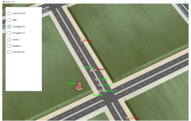
Fig. 3 Example of information display in cell view.

On clicking over a specific cell, the view changes by zooming to its coverage area. Under this view, the transmitter and all user/machines/vehicles connected to it are identified with the same colour. We can see cell-specific statistics and instantaneous values like the load of the cell, SINR experienced by users in the cell, throughput in downlink and uplink, latency, reliability and coverage. Again, instantaneous values could be accompanied with bars representing the statistics of the whole set of values. We could also play with colours to highlight the outage status, as show in Fig. 5, where red font colour is used to depict a throughput below the outage threshold.