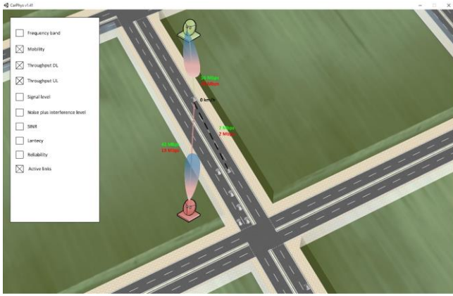
Fig. 5 Example of MS focus view.